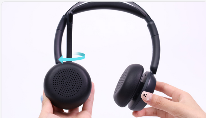
180° rotatable ear muffs

Minimize pressure on ears and head, catering to various head sizes