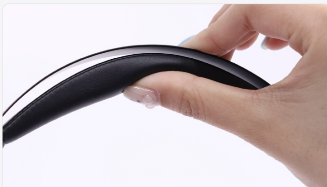
Soft padded leather sling